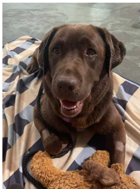
Poppy Therapy Dog